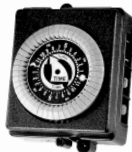
Tripper Clock Timer